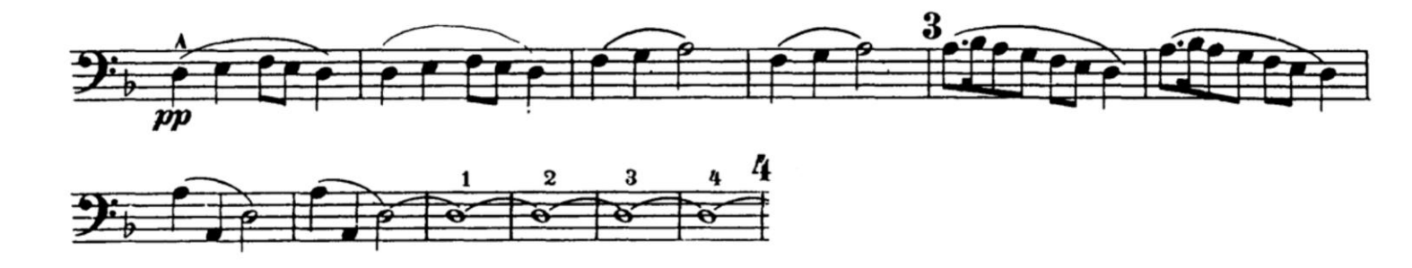
B2: Bruckner: Symphony No. 8, Movement 3, letter H - I (crotchet = 60)

B1: Mahler: Symphony No. 1, Movement 3, 7th bar of figure 2 – figure 4 (crotchet = 70)